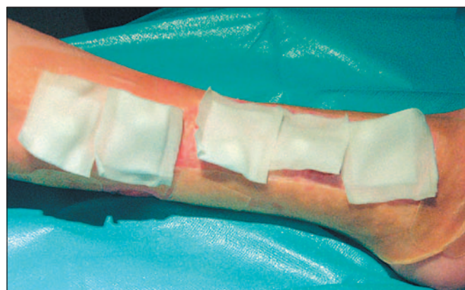
Figure 2. Debridement of the wound surface by maggot therapy using Lucilia sericata captured in special bags