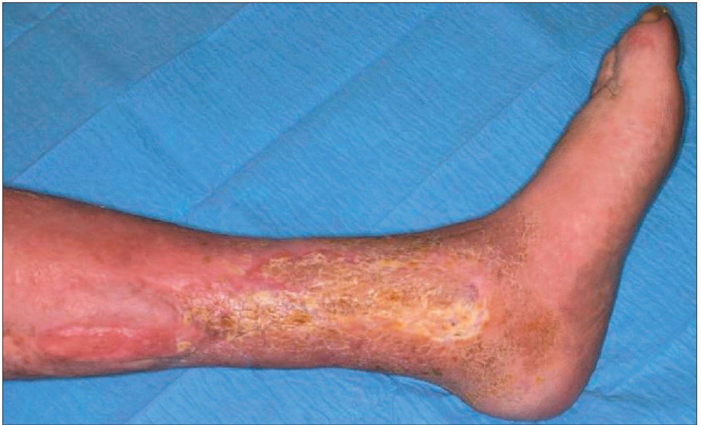
Figure 3. Healing and wound closure after mesh graft transplantation

ment therapy, by the US Food and Drug Administration (510(k) #33391) in 2004 12 , maggots of Lucilia sericata have been widely used to treat infected wounds. 13-15 The aim of this review is to describe the indications for the use of maggots, the effect of MDT in debridement and the underlying mechanisms of action of MDT which are reported in the literature.