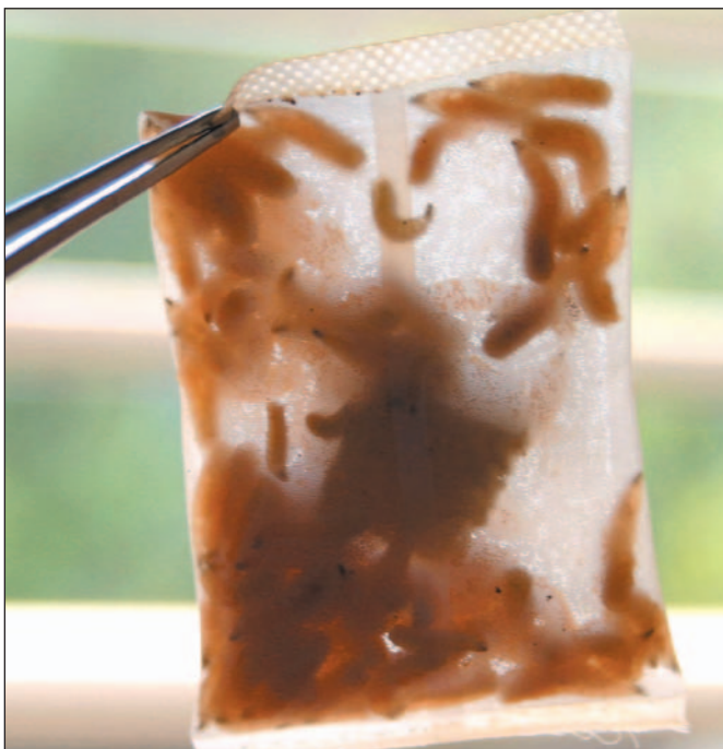
Figure 6. Maggots (Instar 3 larvae) after 4-5 days enclosed in a Biobag®

4). Today in many clinics, a second mode of application of maggots is preferred. The maggots are captured and enclosed in special Biobags® (Biomonde GmbH, Barsbüttel, Germany) that consist of a sterile nylon gauze network, with a foam dressing containing a polyvinyl alcohol spacer 23 ( Figure 5-7 ). The network of the Biobag® is permeable and permits the migration of maggot excretions/secretions (ES) to the wound. This bag facilitates the application of MDT, but also the inspection of the wound bed during the treatment at any time. The effectiveness of the MDT captured in bags or in free-range application seems to be equal 24 but in the case of complicated cavity wounds, free larvae may be preferable. We advise to use a quantity of 1-2 maggots per square centimetre wound sur-