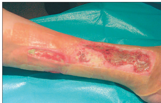
Figure 1. A 76-year-old patient suffering from osteomyelitis of the tibia