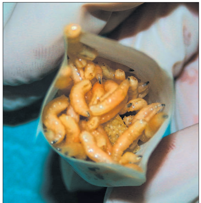
Figure 7. Biobag® after opening filled up with Instar 3 larvae after 4-5 days