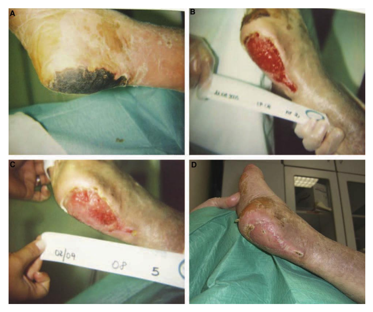
Fig. 2 A case managed with Dermacyn. A) a wide necrotic area in the Achilles tendon region caused by the presence of ischemia and infection induced by trauma from shoes. B) The patient after revascularization, surgical debridement, and 2 weeks of treatment with Dermacyn-saturated dressings. Granulation tissue is present over 100% of the lesion and completely covers the exposed tendon. C) The lesion after another month of treatment with Dermacyn-saturated dressings. A reduction of 25% of the lesion area is noticeable in addition to reduction of the perilesional inflammation signs. This lesion was then suitable for grafting. D) The lesion 3 weeks after the grafting procedure. Complete epithelialization has occurred.

was significantly higher in group A than in group B (87.5% vs 51.4%, P = .00827).