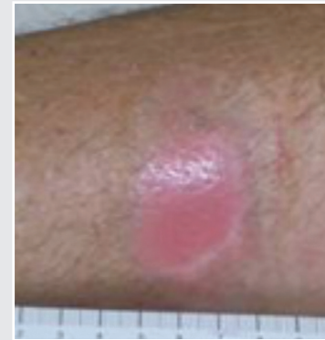
Day 10 Wound closed