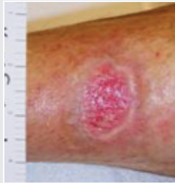
Day 3 OASIS reapplied