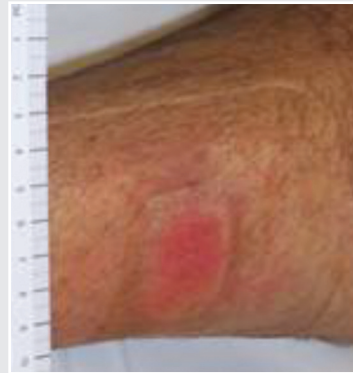
Day 6 Outer dressings reapplied