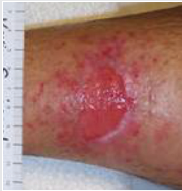
Day 0 Unhealed burn after 33 days OASIS applied

Wound completely closed following 10 days of OASIS treatment. At 4.5 months, patient was noted to have excellent functional and cosmetic outcome.